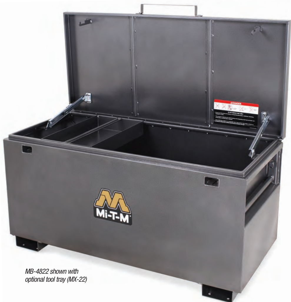
MB-4822 shown with optional tool tray (MX-22)

The Mi-T-M jobsite tool boxes can handle any construction site. Their heavy-duty solid-steel construction offers added protection for your valuable tools and the special locking lid support locks the lid open for easy access. With a powder-coated finish that offers extreme durability in the harshest of environments, these boxes are a must have for all serious contractors.