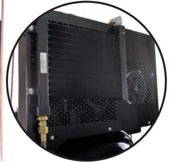
Air-cooled aftercooler removes up to 65% of moisture and drops temperature within 10°F of ambient