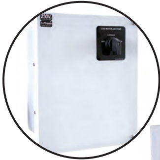
NEMA-4 starter box with magnetic motor starter for thermal overload protection

These standard features are what sets the M Series air compressors apart from our standard line-up.