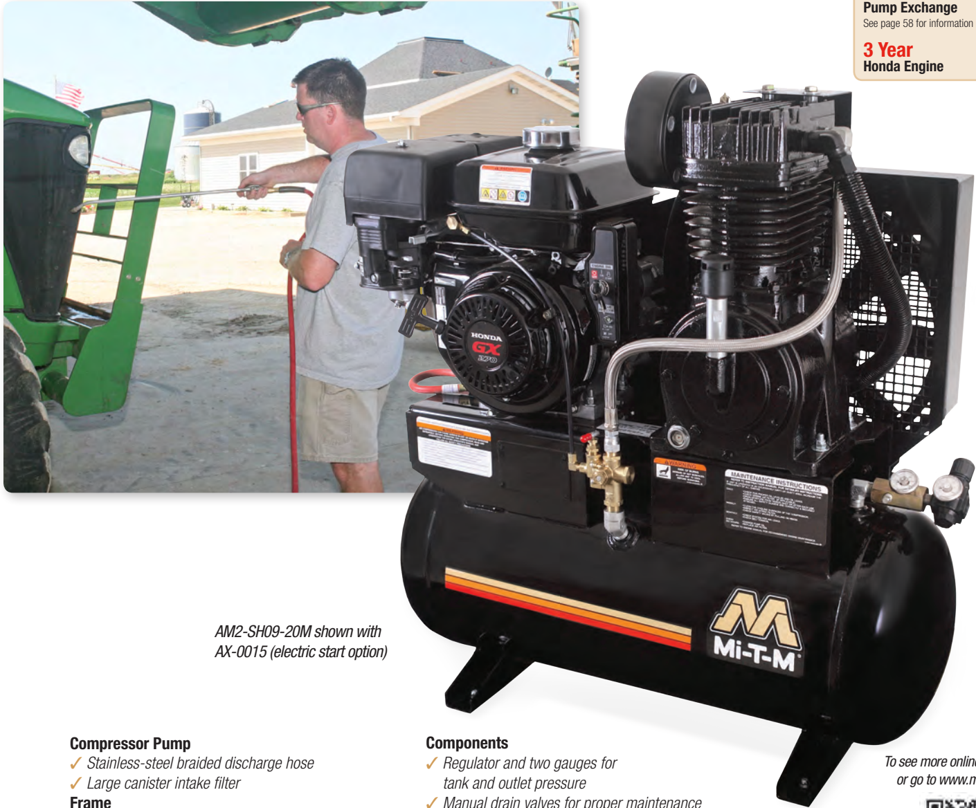
AM2-SH09-20M shown with AX-0015 (electric start option)