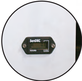
Hour meter displays the number of hours compressor has been in operation