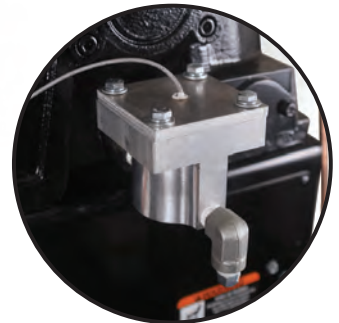
Low oil sensor does not allow unit to start when oil levels fall below an adequate level