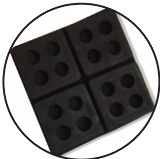
Vibration isolator pads protect the tank from stress