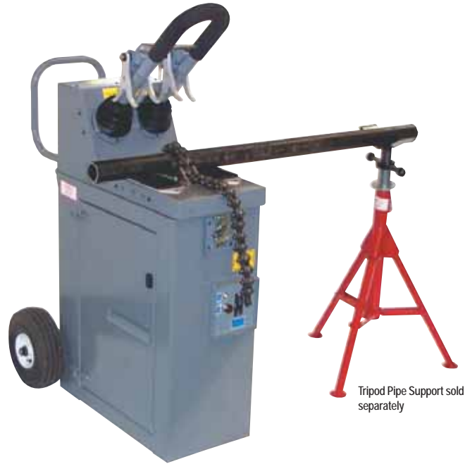
Tripod Pipe Support sold separately

See this pipe cutter in action on our website at www.wheelerrex.com