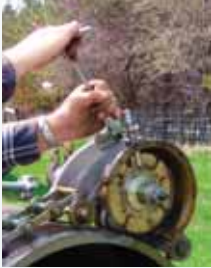
Blade cover removed for photographic purposes.