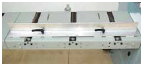
Table Top with Fence