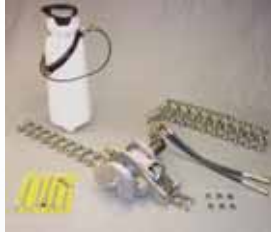
PipeMaster comes with these as standard accessories.