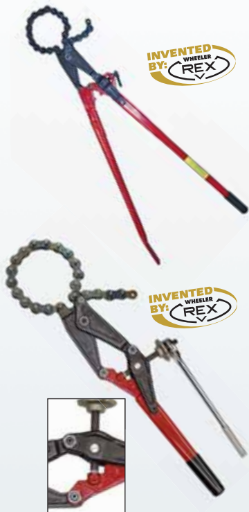
Close-up view of "captured screw"